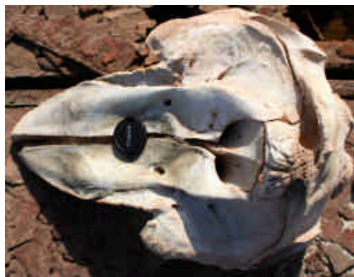
Fig. 6. One of two calvariae of short-finned pilot whale Globicephala macrorhynchus . Lens cover scale is 60mm diameter.

Two calvariae present in the BVRC collection were confirmed to belong to short-finned pilot whale because of distally expanded premaxillae covering the maxillae anteriorly, wide alveoli and a short and broad rostrum (cf. van Bree, 1971).