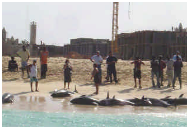
Fig. 2. Mass stranding of ca. 70 melon-headed whales on Praia de Boca da Salina, Boavista, 19 November 2007. Some 65 specimens were successfully refloated and headed to deeper water.

An informal Boavista biological reference collection (BVRC) has been maintained at Sal Rei for some years. It currently includes skeletal remains of 22 cetaceans: 17 skulls (two with complete skeleton) of Peponocephala electra , short-finned pilot whales Globicephala macrorhynchus (n=2), false killer whale Pseudorca crassidens (n=1), rough-toothed dolphin Steno bredanensis (n=1), and common minke whale Balaenoptera acutorostrata (n=1).