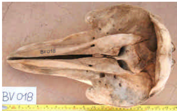
Fig. 5. Adult Peponocephala electra skull (BV 018). Dorsal and ventral high-resolution images of skulls allow specimen recognition independent from numbering.

Probably same origin as BV018. Date examined: 13.01.2008. Skull (adult); no TP or teeth.