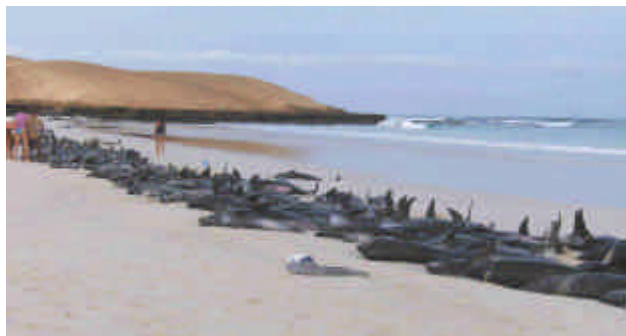
Fig.1. Mass stranding of ca. 265 melon-headed whales at Praia da Chave, Boavista, photographed on 18 November 2007, the day after the initial stranding.

Two mass stranding events of, respectively, 265 and 70 (65 of which survived) melon-headed whales Peponocephala electra (Gray, 1846) occurred with about a day interval on western Boavista Island (Ilha da Boavista) in the Cape Verde Islands from 17-19 November 2007 (Figures 1 & 2). Local authorities immediately buried dead animals in a mass grave on the beach, which unfortunately impeded necropsies and postmortem sampling.