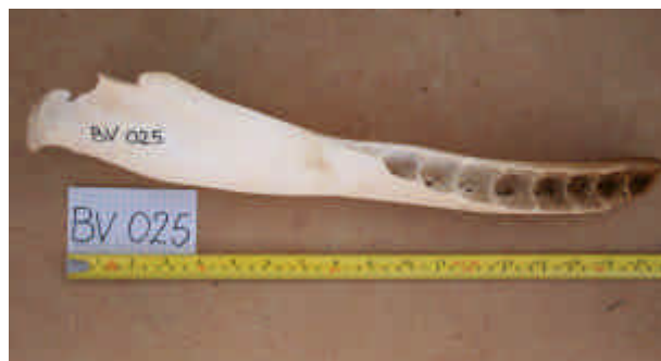
Fig. 8. Right mandible (BV 025) of a false killer whale Pseudorca crassidens . Note the 8 large, circular alveoli (oval in killer whales) and the tooth row extending for almost half the length of the mandibula (about 1/4 in short-finned pilot whale).

On 23 November 2007, i.e. four days postmortem, PLS performed an in situ necropsy of a 260cm adult male on Praia de Boca da Salina, with findings as follow. Body condition was good with normal blubber thickness and no signs of emaciation. No external traumatism was visible, apart from some tooth rakes from social interactions, and no external parasites. No macroscopic pathological lesions were found, while tissue damage was congruent with normal postmortem autolysis of internal organs. Abdominal organs examined included liver, pancreas, spleen, some mesenteric lymph nodes, testes, kidneys and gastrointestinal tract. No internal hemorrhages nor other gross pathologies or abnormalities were evident. Stomachs and different sections of the intestine were opened and some unidentified nematodes were seen attached to the gastric mucosa. A few squid beaks were collected, but otherwise no food remains were found in the various sections of the intestinal tract. In the thoracic cavity, accessed through the diaphragm muscle, heart and lungs (apical lobes) appeared normal. At the request of INDP, a sample of skin, blubber and muscle from the dorsal region of the animal was collected for the local environmental authorities.