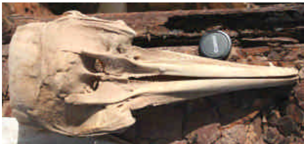
Fig. 7. Dorsal view of rough-toothed dolphin Steno bredanensis skull (BV026). Lens cover scale is 60mm in diameter.

One skull (Figure 6) was collected by PLS on the northern coast of Santa Luzia Island in February 2001, first encountered there during an expedition in October 1999. An unknown number (> 3) had been involved in a stranding on the island. The other skull was collected by Mr. G. Torda at Ponta Calheta Negra, NE coast of Boavista, in September 2003, from a mass stranding of more than 20 animals that took place before 1999.