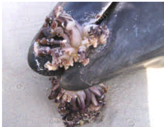
Fig. 11. Rostrum of a melon-headed whale infested with stalked barnacles Conchoderma auritum . These commensals are uncommon in delphinids and are often associated with congenital or acquired deformations where the mouth cannot be properly closed and teeth remain permanently exposed.

Stranding circumstances on Boavista were reminiscent of an averted mass stranding of 150-200 animals of the same species that occurred in the shallow waters of Hanalei Bay, Kaua'i, Hawaii, on 3-4 July 2004 (Southall et al. , 2006). The latter well-documented event was spatially and temporally correlated with Rim of the Pacific Exercises (RIMPAC). Sonar training and tracking exercises were held and six naval surface vessels transiting to the operational area on 2 July 2004 intermittently transmitted active sonar, as reported by NOAA (Southall et al. , 2006).