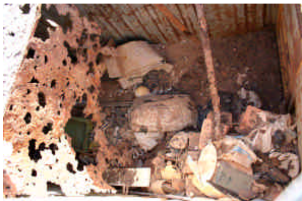
Fig. 4. Dilapidated shipping container in Sal Rei, Boavista, functioning as temporary holding space for unprocessed cetacean and sea turtle skeletal specimens. While it keeps specimens safe from dogs, people may have access.

Date examined: 11.01.2008. Surface specimen. Subadult skull collected. No sex, length or other data.