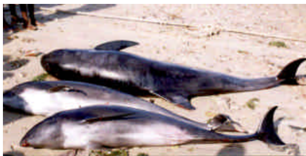
Fig. 12. Three melon-headed whales landed in a Ghana port and sold for human consumption.

Reportedly some of the melon-headed whales that died were utilized for food, which is a common habit throughout coastal West Africa (see Clapham and Van Waerebeek, 2007; Ofori-Danson et al. , 2003), but also in northern Brazil (e.g. Lodi et al. , 1990). The rostra of at least five specimens had been cut off to extract teeth for locally made jewelry, for sale in tourists shops at Sal Rei.